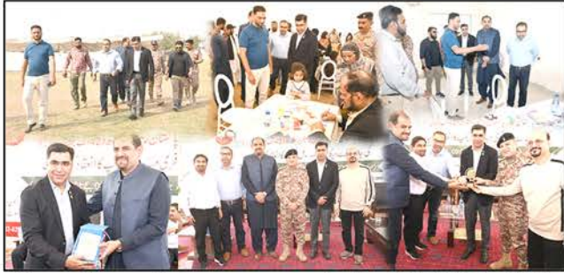
A mega free medical camp was organized by UPF Pakistan, KATI members along with Pakistan Rangers Sindh (42 Wing Bhattai Rangers) The event was graced by the presence of distinguished individuals, Sector Commander Bhattai Brig Abdul Ghafoor and Wing Commander Irtaza were presented with souvenirs for their notable contributions during the event, On Dec 9 th , 2023.