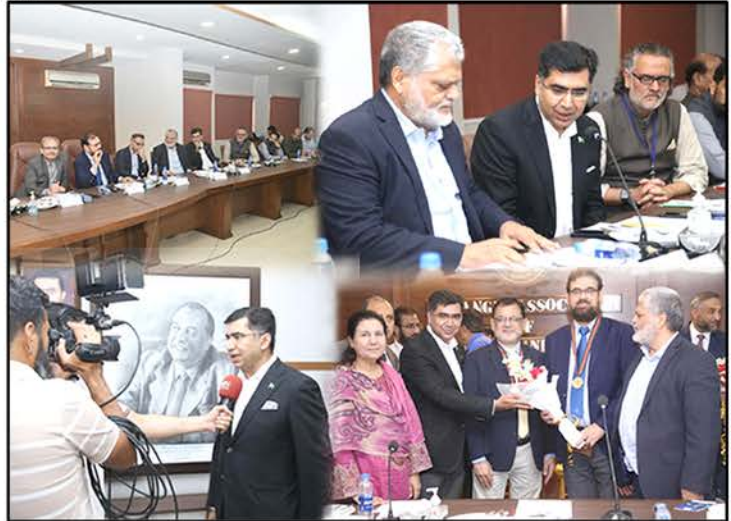
The seminar, acknowledging the outstanding (CSR) activities and presentations highlighting the services and contributions of